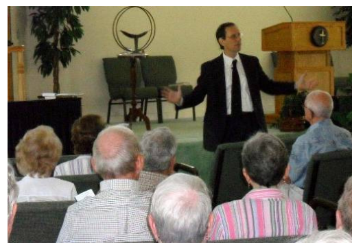
Teaching UU History at Forum